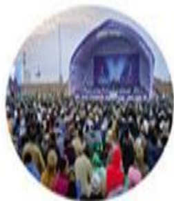
JALSA GAH QADIAN