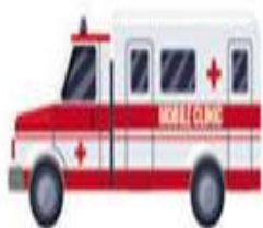
MOBILE HEALTH CLINICS